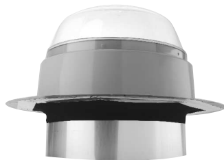
Solatube Models 21-O and 21-C

Note: Solatube Models 21-O and 21-C Flashing Insulator is applied in similar fashion, but flashing shape is round.